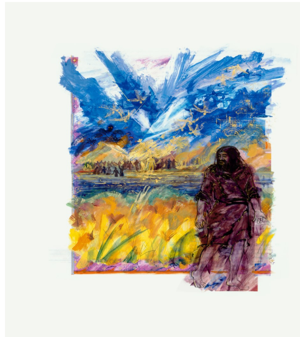
Baptism of Jesus, Donald Jackson, Copyright 2002, The Saint John's Bible, Saint John's University, Collegeville, Minnesota USA. Used by permission.