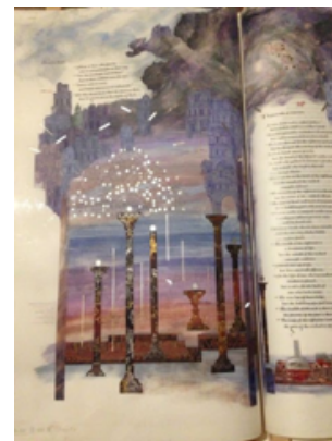
Figure 1 Seven Pillars of Wisdom Illumination - The Saint John's Bible

"The same stone which the builders rejected has become the chief cornerstone." Psalm 118:22